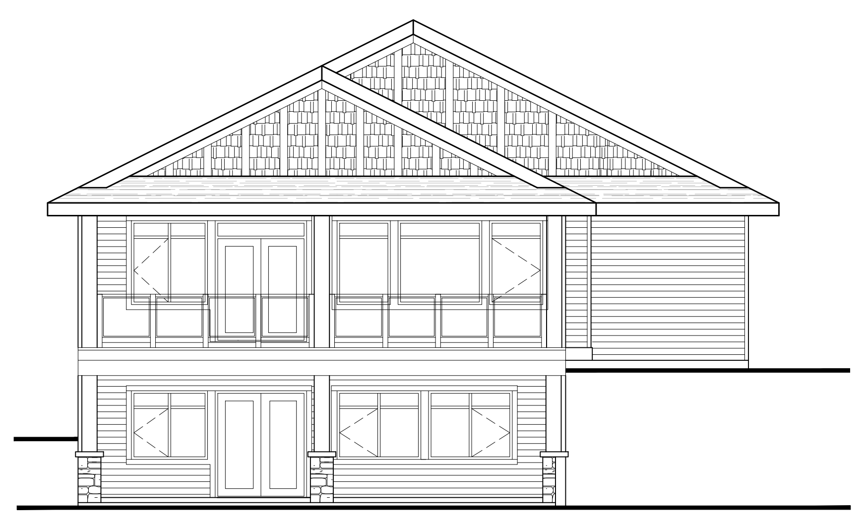
REAR ELEVATION WITH OPTIONAL WALK OUT BASEMENT