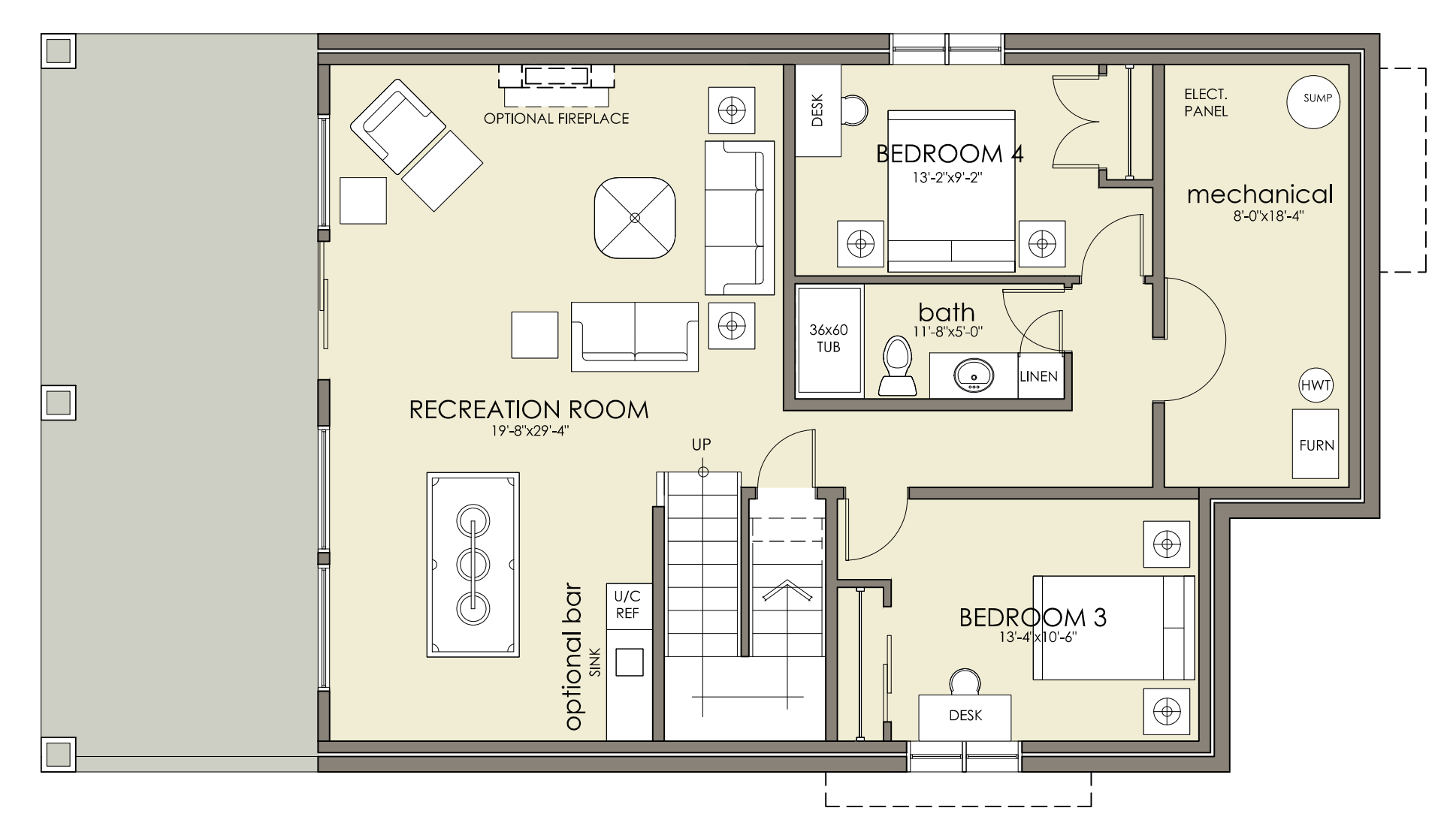
OPTIONAL FINISHED BASEMENT FLOOR PLAN 1319 SQ. FT. 2 BEDROOMS / 1 BATH

The developer reserves the right to modify the floor plans, architectural features and finishes without notice unless agreed upon in a purchase contract. All renderings, maps, plans and other images are provided to assist purchasers in visualizing the project and may not accurately represent the final product. Square footages and lot dimensions are calculated based on architectural measurements and lot plans and thus may differ from the actual surveyed unit areas, as set forth on the registration plan.