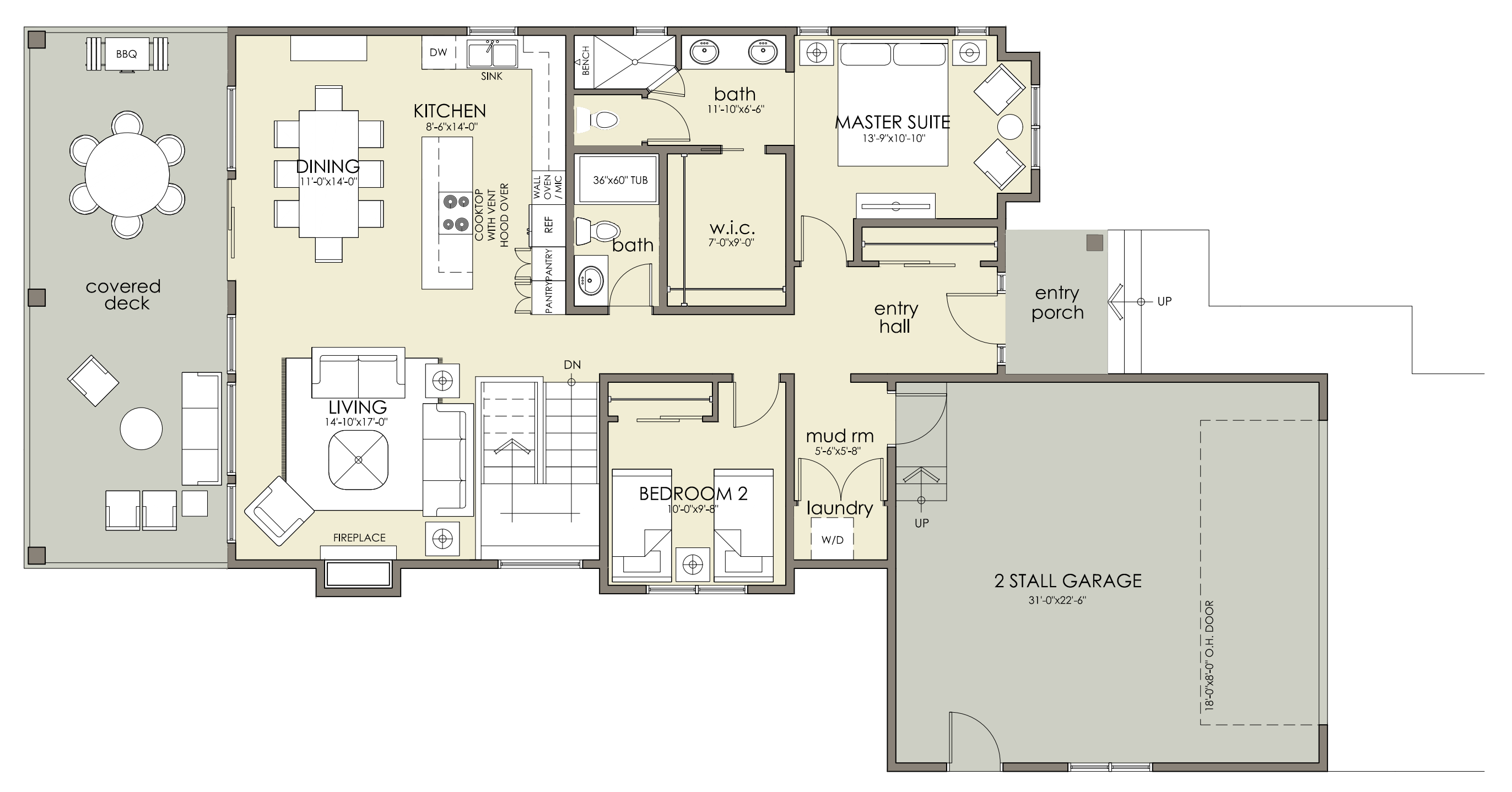
MAIN FLOOR PLAN 1432 SQ. FT. 2 BEDROOMS / 2 BATHS MAIN FLOOR LAUNDRY